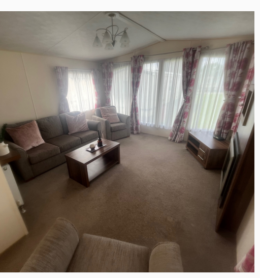
Comfortable lounge with large front windows